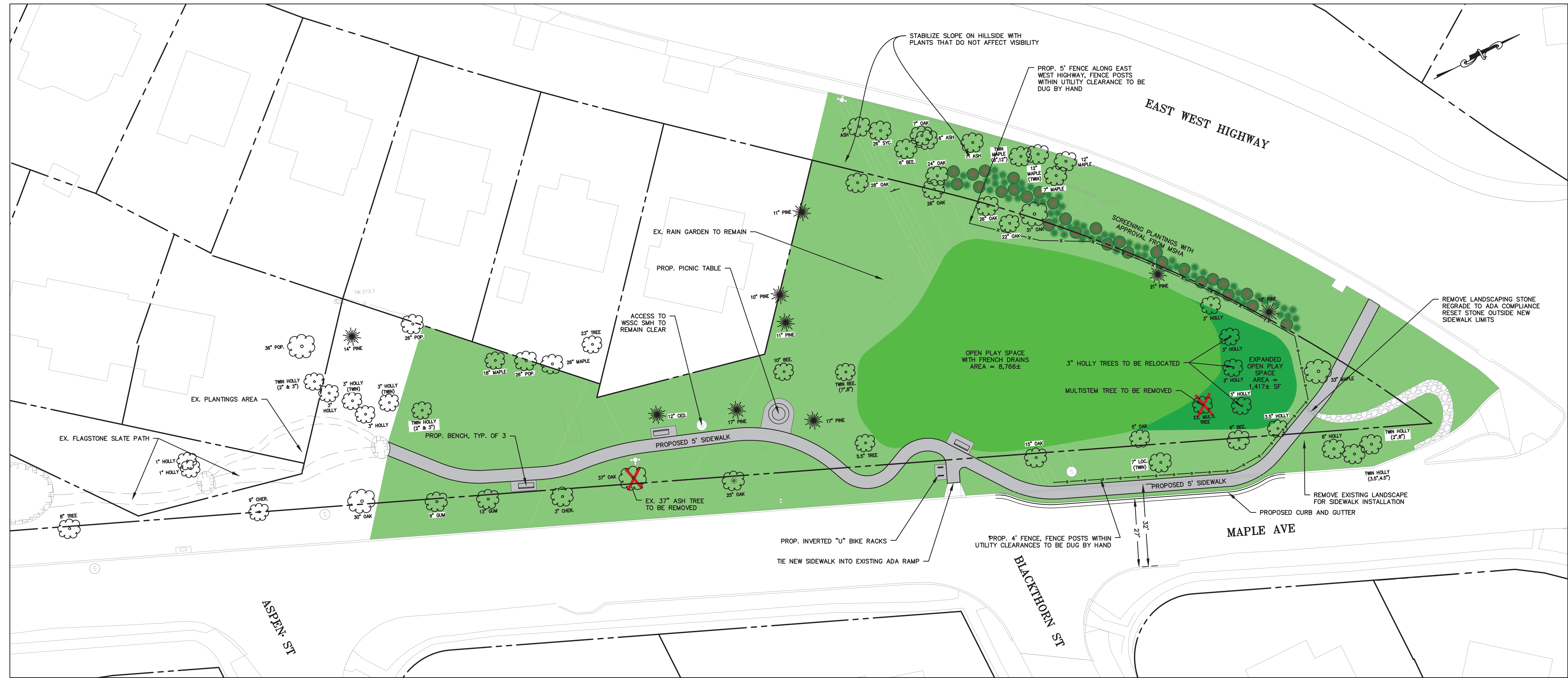
SITE PLAN 1" = 20'

J:\785.001 - Zimmerman Park\CAD\CONCEPTS\CONCEPT 6 - COLOR.dwg 2/20/2022 8:34 AM